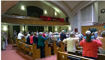
The entire church on its feet doing the Chicken Dance!